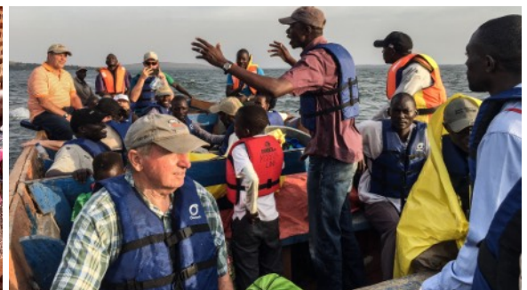
Team traveling by boat to Buvuma Island, Lake Victoria