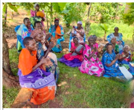
Above, a few of the widows in Idome praising the Lord for answering their prayers. Visit our widow's page to see more: missionlink.org/widows