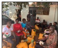
MLU Staff Christmas Dinner & Widow's Blessing